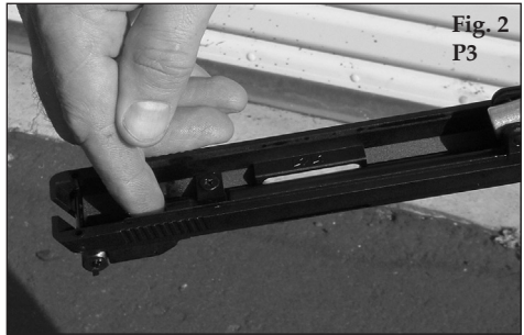
Fig. 2 P3