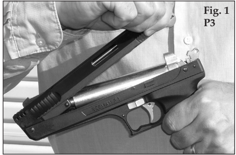
Fig. 1 P3